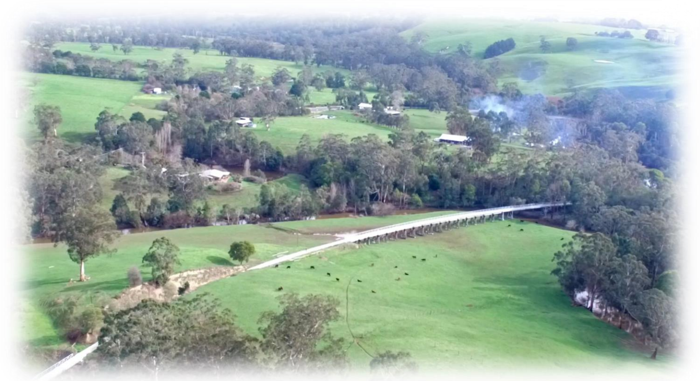
Area Name: 3. River Flats/Tree Top Walk