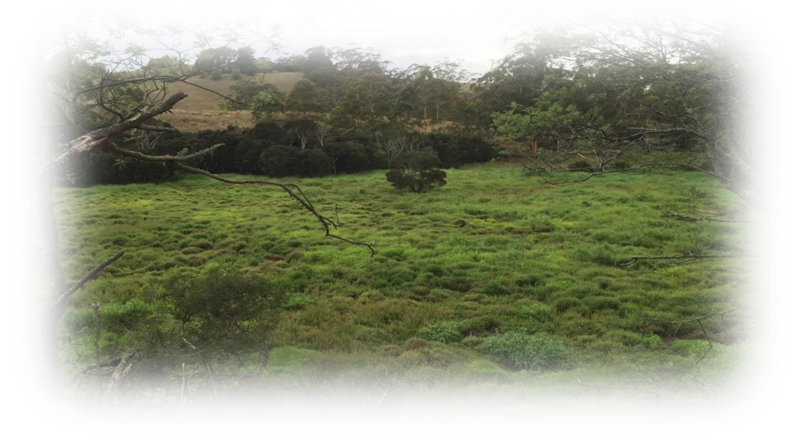
Area Name: 1. Black Spur Wetlands Confluence