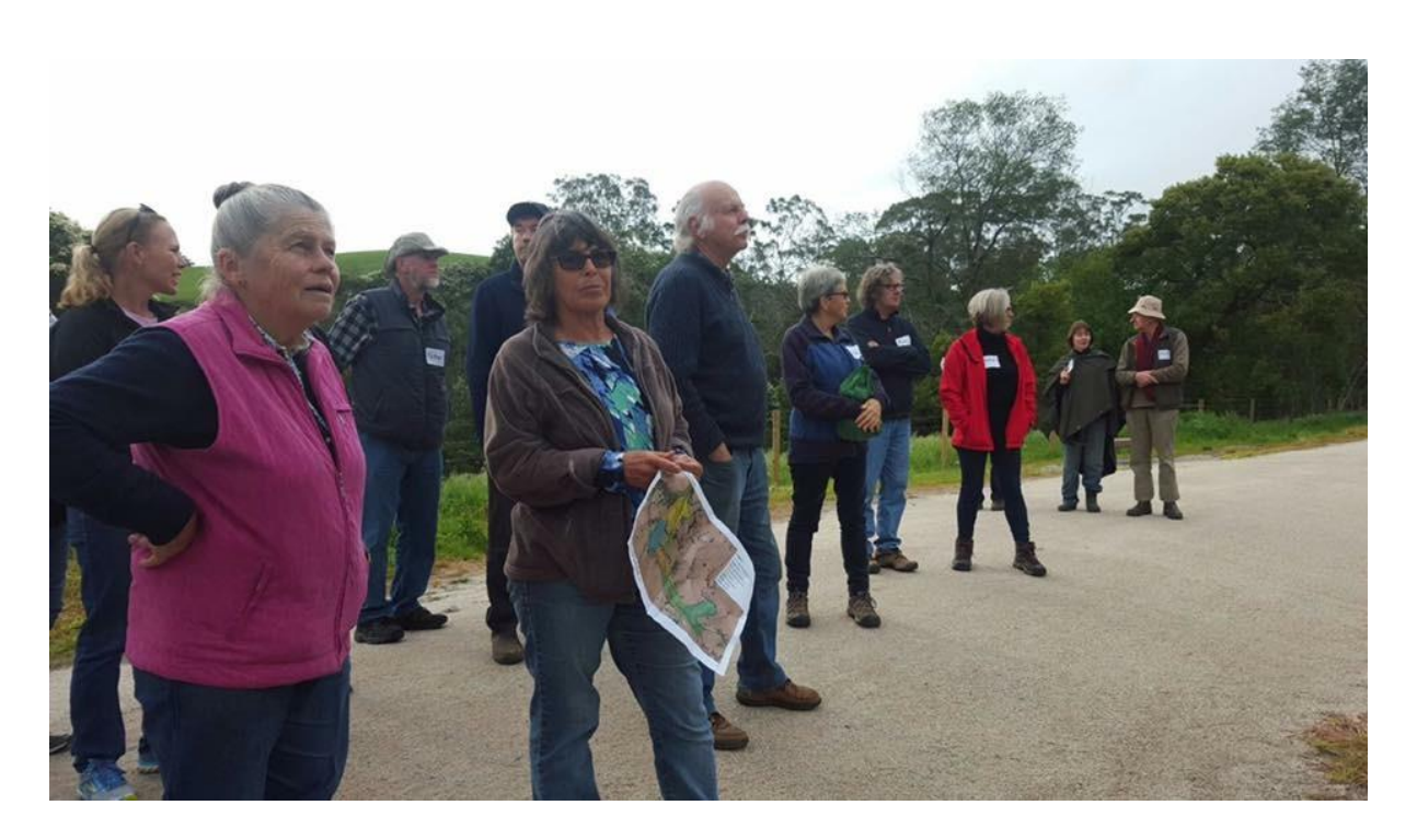
This photo was taken during a site visit and consultation for the project

Landcare do not have the capacity to take on maintenance roles, so projects will need to be undertaken with sustainability in mind.