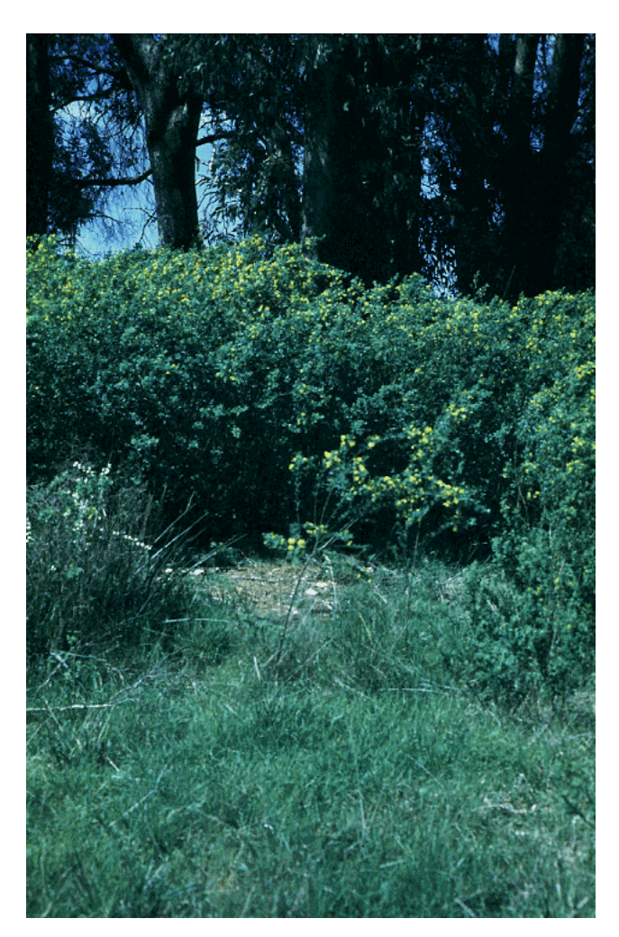
Figure 2. Cape broom infestation.

Flax-leaved broom, Genista linifolia L., is also a declared weed in Victoria. It can be distinguished by its stalkless or nearly stalkless leaves which have rolled edges and are densely hairy on the underside.