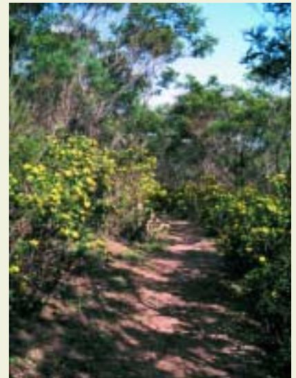
Boneseed restricts access to tracks in the You Yangs Regional Park.

A program known as 'Adopt a block' has been running at the park since 1987. About 30 volunteer organisations, including 4WD clubs, scout groups and schools each have a 1 ha block which they visit once a year to remove the boneseed. In some blocks, boneseed has been eradicated and they are now planning revegetation with native species.