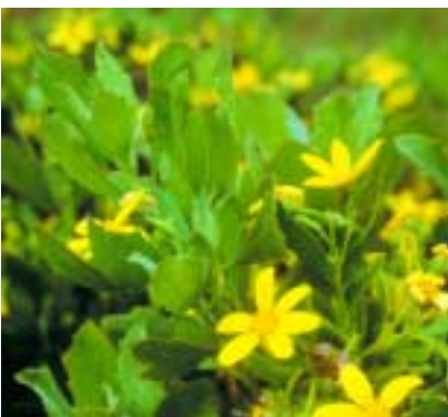
Each bush can produce thousands of flowers and up to 50,000 seeds per year.

Any boneseed plants in gardens should be destroyed since they represent a seed source and hence potential for further spread.