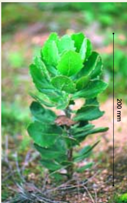
Young boneseed seedlings are easy to pull by hand.

Hand pull isolated plants before they set seed. Small infestations can be treated with herbicide applied by spot spraying