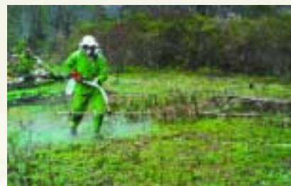
After burning, herbicides are used to kill freshly germinated seedlings.