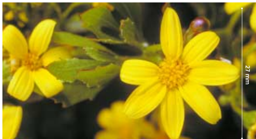
Peak flowering occurs between August and October.

There is considerable community interest and awareness of the adverse impacts of boneseed and bitou bush, especially in coastal areas. This is evident in the hundreds of volunteer coastal care and 'friends of the parks' groups which direct much of their energy towards removing these weeds.