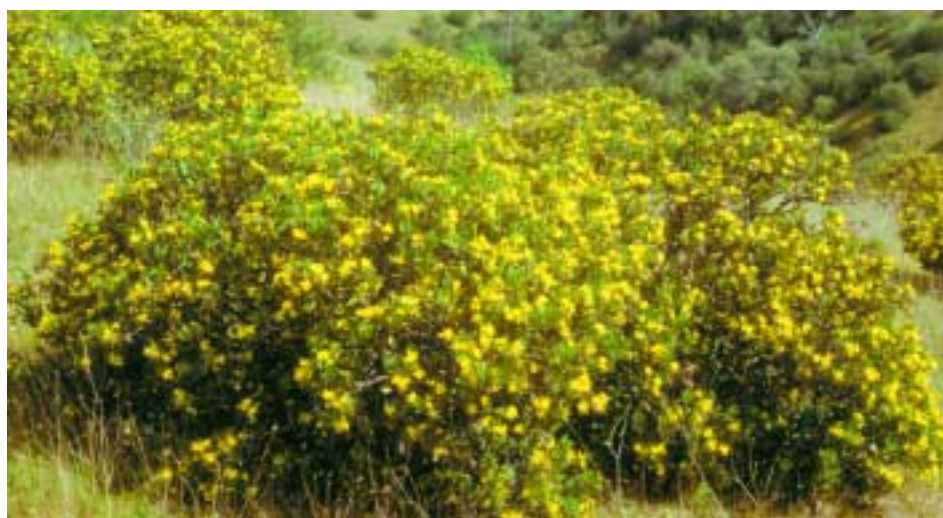
Boneseed grows under a wide range of climatic conditions but prefers disturbed situations: Mount Lofty Ranges, SA.

A perennial shrub, which grows up to 3 m high, boneseed reproduces by seed. In contrast to the closely related bitou bush ( Chrysanthemoides monilifera ssp. rotundata ) which has a sprawling habit, boneseed is an erect shrub. It is relatively short-lived (10–20 years).