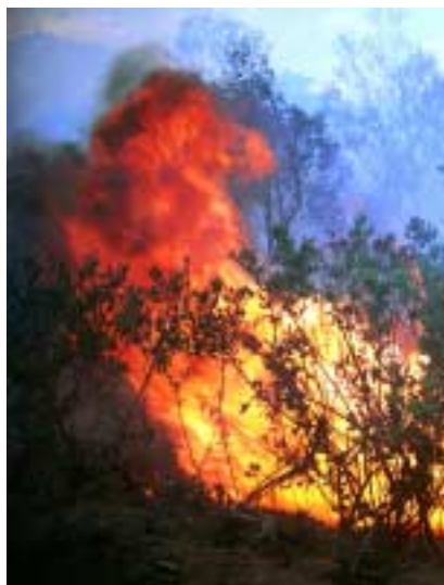
Fire kills boneseed but can also stimulate mass germination of seeds.

Burning will trigger mass germination of boneseed and may also improve access for herbicide application. Spraying small seedlings in the first few months after germination is generally ineffective because they are quickly replaced by new ones. It is better to spray at the end of seedling emergence but, even then, follow-up control will be needed in subsequent years after further germination has taken place.