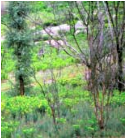
Seeds germinate at any time of the year but mostly in autumn: You Yangs Regional Park, Vic.

When using herbicides always read the label and follow instructions carefully. Particular care should be taken when using herbicides near waterways because rainfall running off the land into waterways can carry herbicides with it.