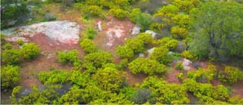
The yellow-flowering boneseed infests two thirds of the You Yangs Regional Park, Vic.

A range of effective control measures for boneseed are available, including hand pulling, herbicide treatment and fire. Natural regeneration or over-sowing with locally collected seed of native species is an important part of the rehabilitation process.